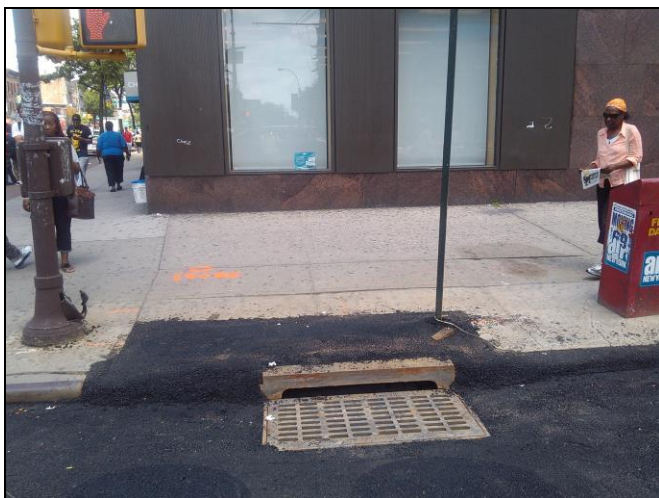
Installation of catch basin at the intersection of Church Avenue and Flatbush Avenue with temporary asphalt overlay until final roadway paving occurs.