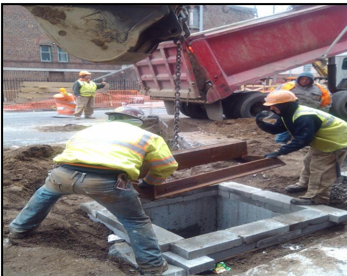
Installation of Catch Basin at the intersection of Wood Place and Church Avenue.