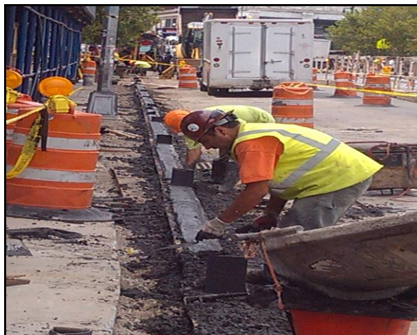
Installation of Pigmented Curb on Church Avenue between Bedford Avenue and Flatbush Avenue.