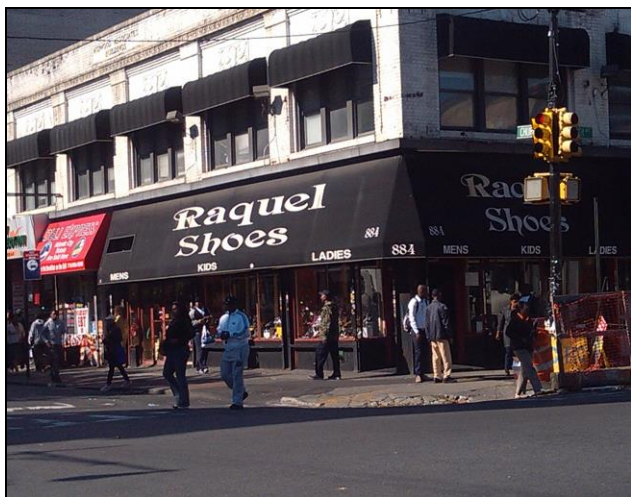
Curb and Sidewalk work are scheduled for Church Avenue and Flatbush Avenue.