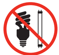
light bulbs or ballasts

To schedule a pick-up visit nyc.gov/electronics