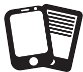
tablets & e-readers